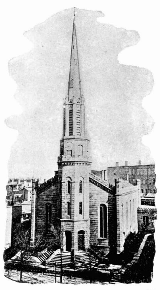
Edifice, Second Presbyterian Church on Superior Street, to which the Luther Crowells belonged.