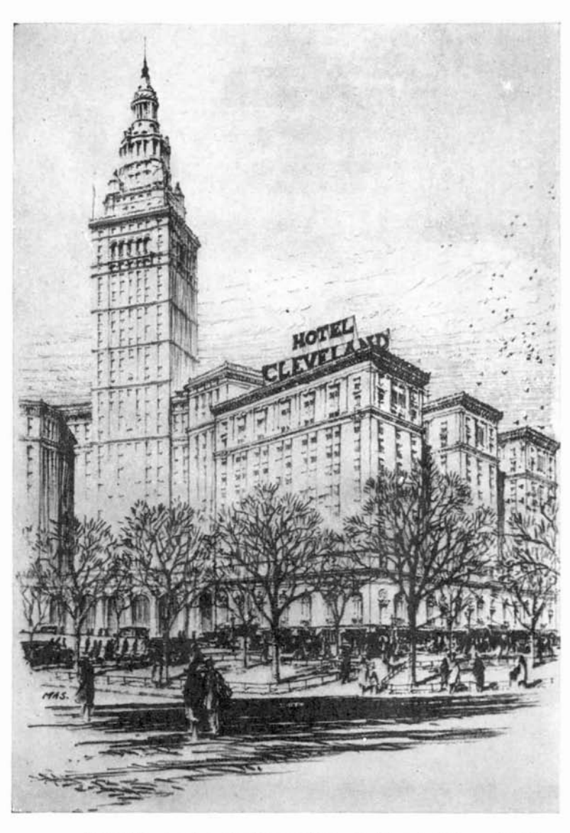
Hotel Cleveland and its Siamese Sister, the Terminal Tower Building. The Public Square is in the foreground; the shabby little Cuyahoga River, degenerate from city contacts, at the rear, happily out of view. These buildings center an area of six hundred acres where the City of Cleveland began. Within a yard-arms distance, there was once a street called "Sheriff," now Fourth, where Mr. Crowell was born.