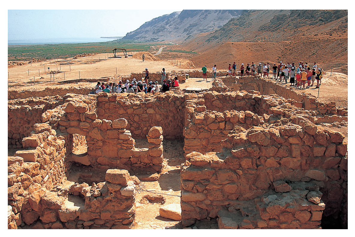
The settlement buildings at Qumran. Some of the Dead Sea Scrolls were found at Qumran.

the pages of Holy Writ and establishes a personal relationship, rather than merely instilling propositional truth into his mind. (Propositional here refers to the kind of truth which may be stated in propositions, such as, "God is an eternal Spirit." Propositions may be grasped as mere objects of knowledge, like mathematical formulas; but divine truth, it is urged, can never be mastered by man's mind. Divine truth reaches man in an "I-Thou" encounter; it is like an electric current with both a positive pole and a negative pole as conditions for existence.) Since the biblical text was written by human authors, and all men are sinful and subject to error, therefore, it is claimed, there must be error in the biblical text itself. But, it is argued, the living God is able to speak even from this partially erroneous text and bring believers into vital relationship with Him in a saving encounter.